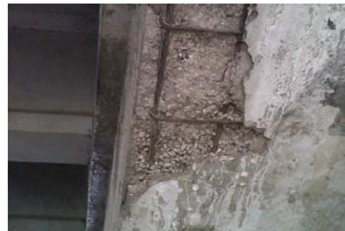
Prolonged water leakage leads to structural damage.