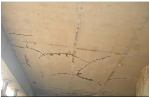
The cracks developed below the podium, and water leaking through it.